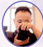
Bovito Swu Freelancer Photographer