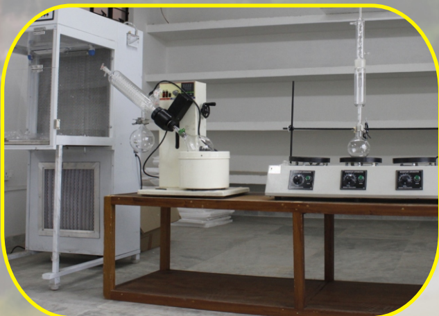
Phytochemical Screening Lab