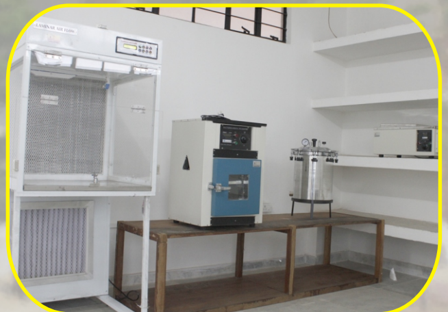
Tissue Culture Lab