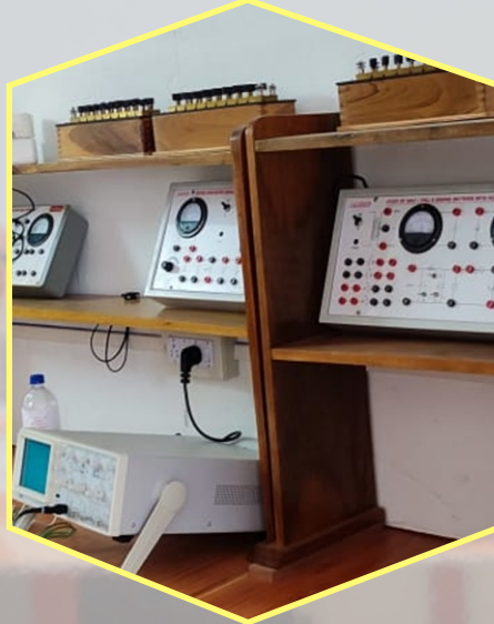
Physics Electronic Laboratory