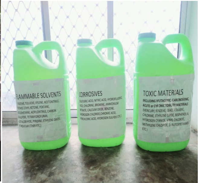
Chemical Waste Management