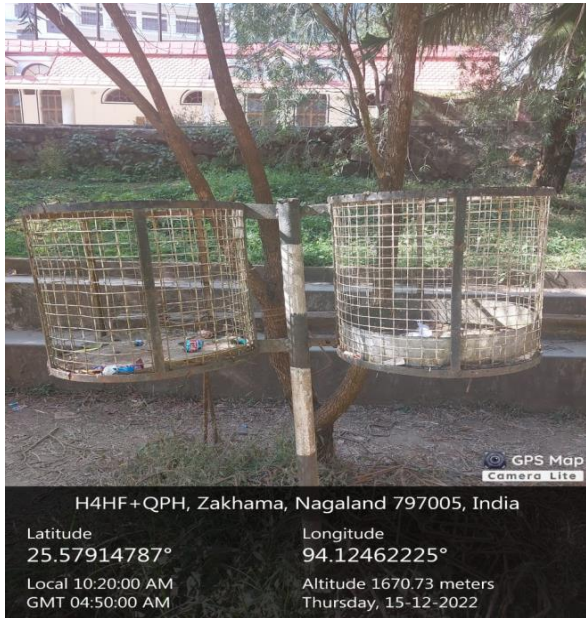
Waste Collection Basket