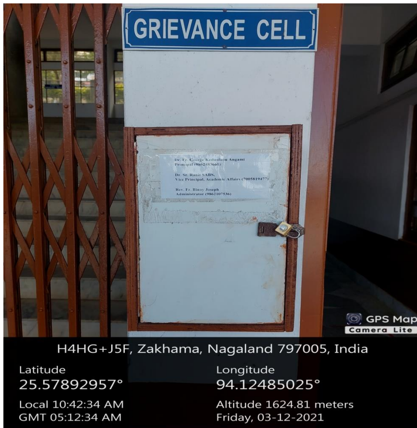
College Grievance Cell Box